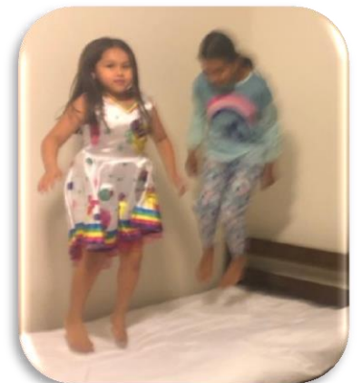
How much fun to have a "good jump" on your own bed before the Rotarians added sheets and comforters.