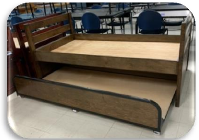
One of five trundle beds designed and built by Manufacturing and Construction Technology Academy students at Monache High School in Porterville.