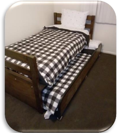
One of the five trundle beds as delivered to families in the Porterville area.

The beds were delivered and set-up by Porterville Rotarians. Many of the families receiving beds were field workers and the deliveries had to be made in the evenings after they returned from work. The goal was to make all the deliveries prior to the Christmas holidays. The last trundle bed was delivered on December 17, 2021.